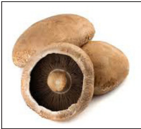
#26658 Large Portobello (Case #5)