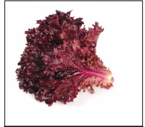
# 68552 Red Leaf Lettuce (Case 24 Ct TP)

AVAILABLE FOR THE WEEK OF 10/3/22 – 10/8/22